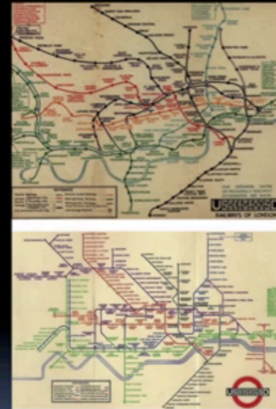
The London Underground 1928 Map & the 1933 map by Harry Beck.